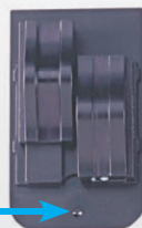
Ball allowing the adjustment of the compartment door