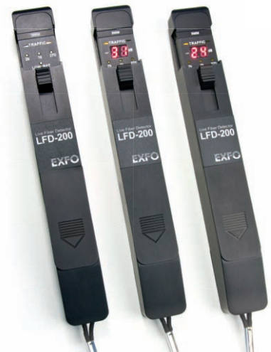
LFD-201 LFD-202 LFD-202E

The LFD-200 also features a unique Hold button that enables hands-free operation. Just push up the button and click it down. You are now free to operate your setup.